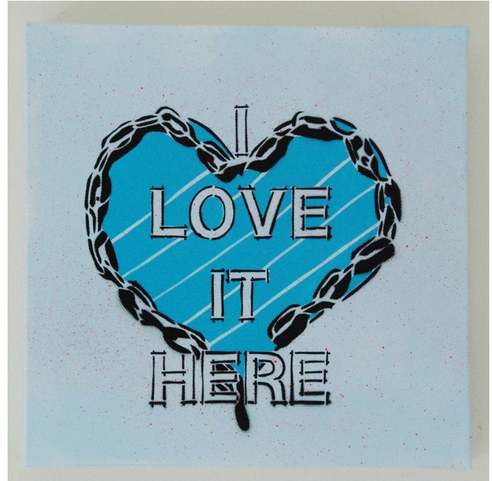
"I love it here (blue)"